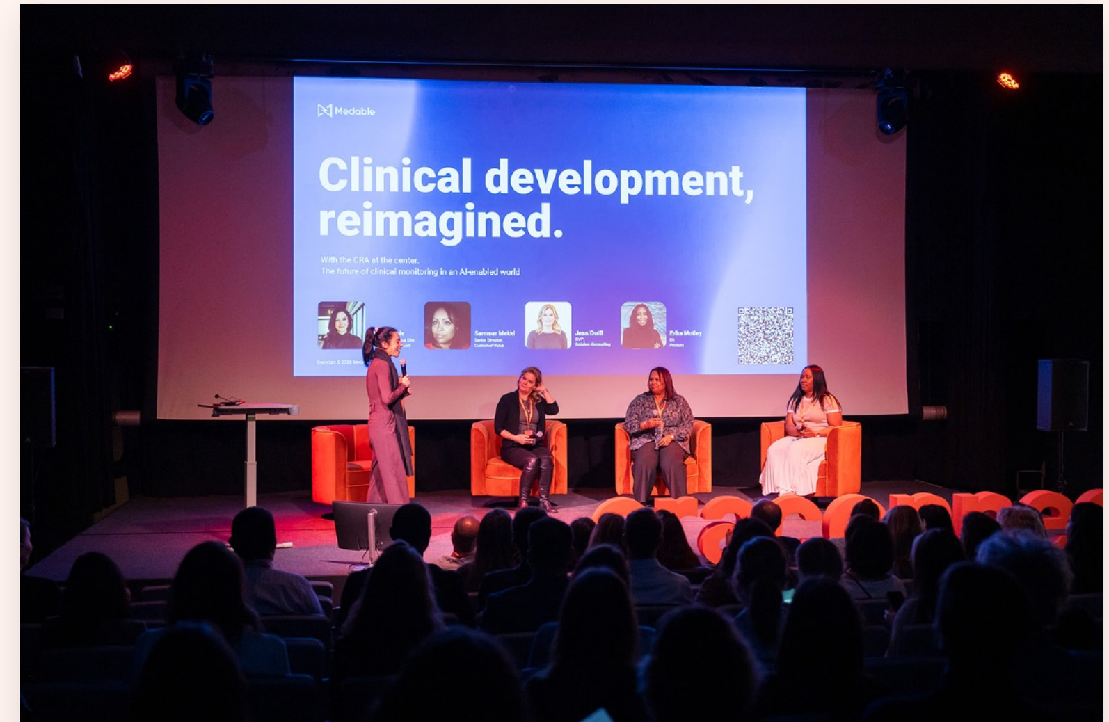
Medable opens CRACONNECT LIVE 2026 — the keynote on the main stage.

The room pressed hard on trust: hallucinations, audit trails, prompt security, and Medable pointed to daily validation, complete logs and platform-level guardrails. The takeaway set the tone for two days: the future of monitoring isn't CRAs or AI — it's CRAs, with better tools, doing the part of the job that always mattered most.